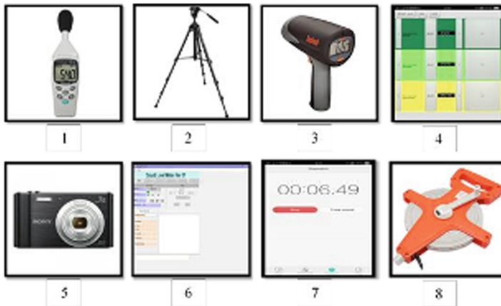
Fig. 1 Noise measurement equipment